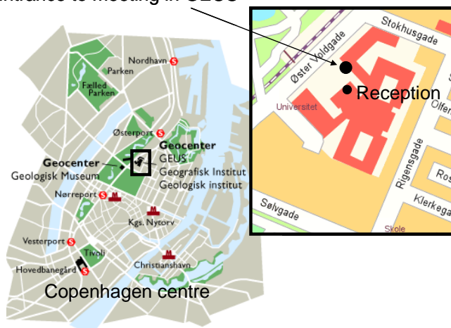
Entrance to meeting in GEUS

GEUS – Geological Survey of Denmark and Greenland Øster Voldgade 10 1350 Copenhagen K