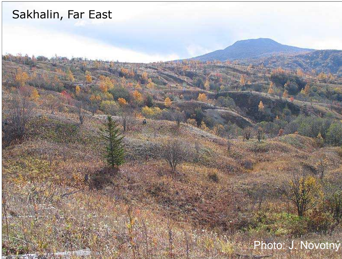
Sakhalin, Far East