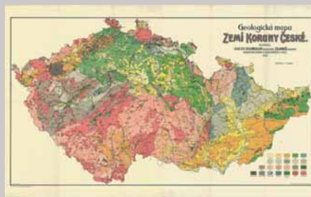
Geological map of the Crown Lands of Bohemia. Karel Absolon, Zdeněk Jaroš.

(Archive of the Czech Geological Survey – ref. # M2B329/23)