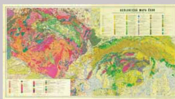
Geological map of ČSSR (Czechoslovak Socialistic Republic). – East, West.

(Archive of the Czech Geological Survey – ref. # M2C38)