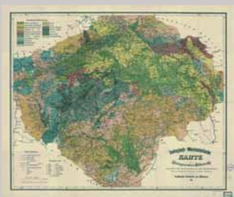
Geologisch-montanistische Karte des Königreiches Böhmen

(Archive of the Czech Geological Survey – ref. # M2B329/49)