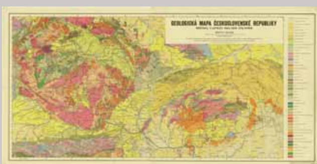
Geological map of Czechoslovakia (Czechoslovak Republic)