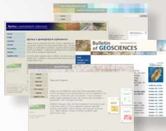
CGS Periodical Publications on-line

For orders please send e-mail to obchod@geology.cz .